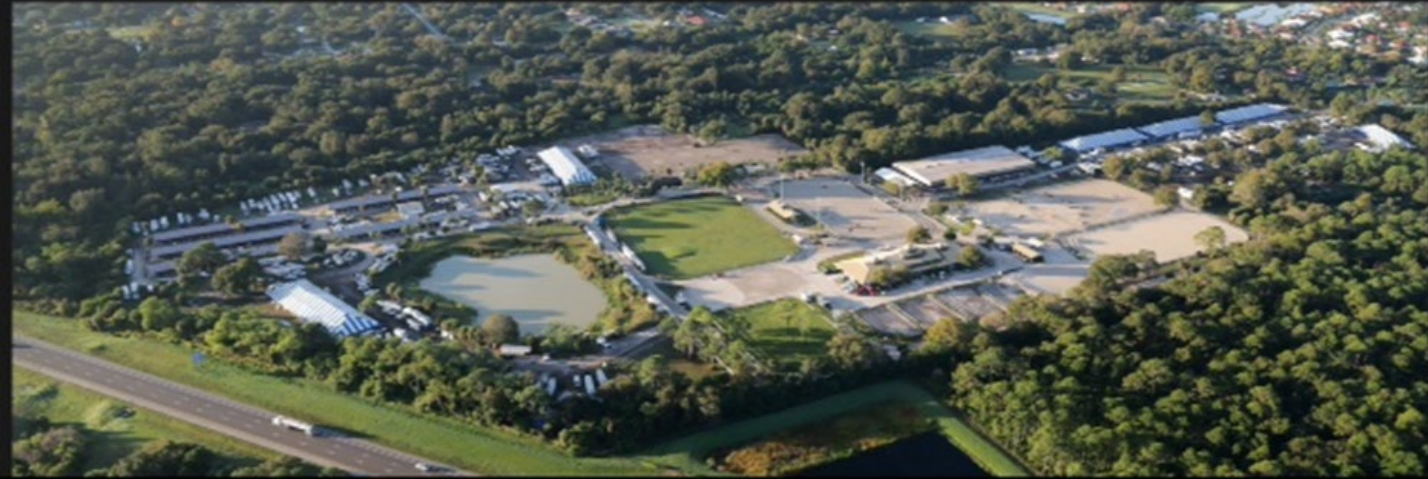
FOX LEA FARMS, VENICE FL